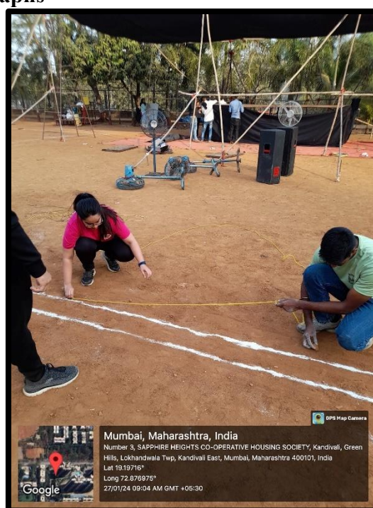
Sample photo of the event