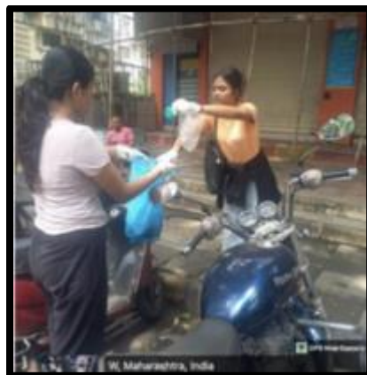
Sample photos of the event