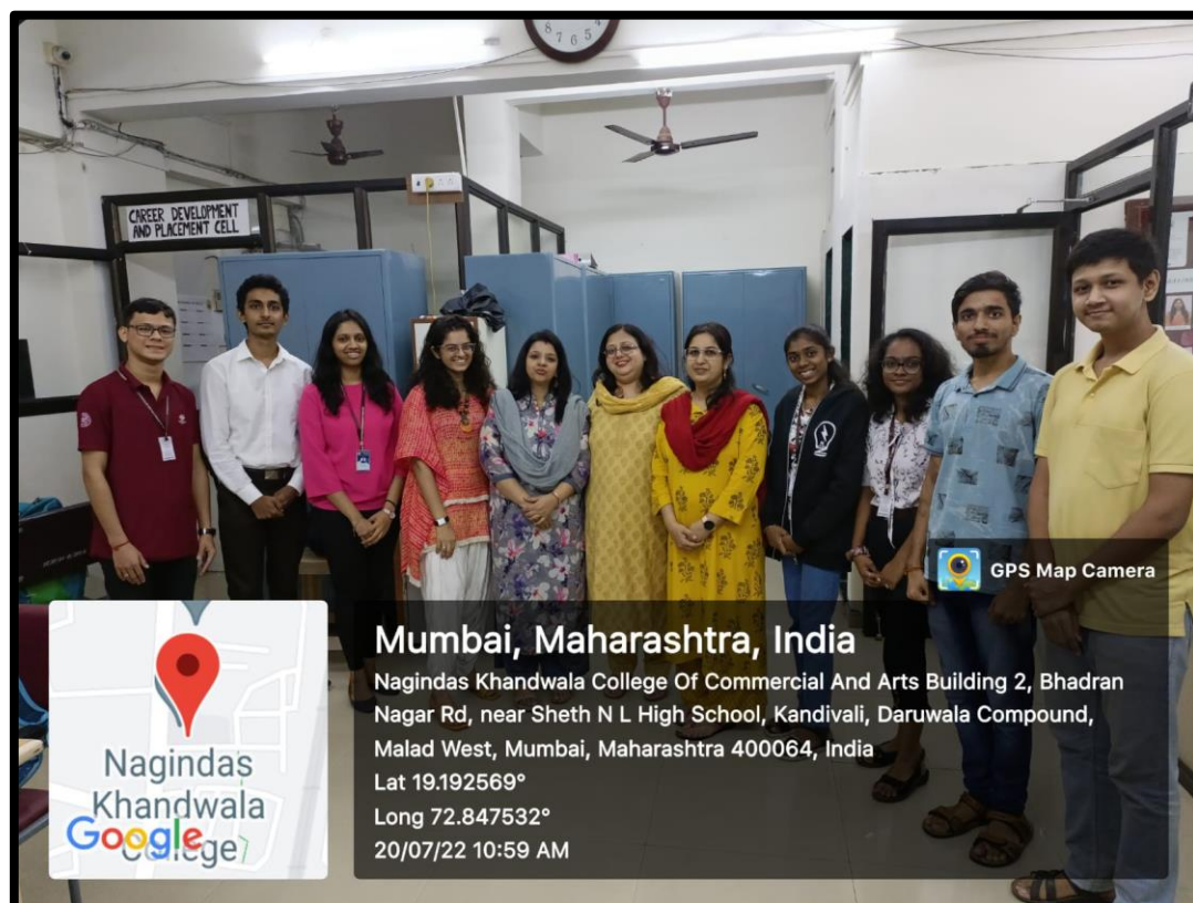
Incubate & Team – Incubation Cell