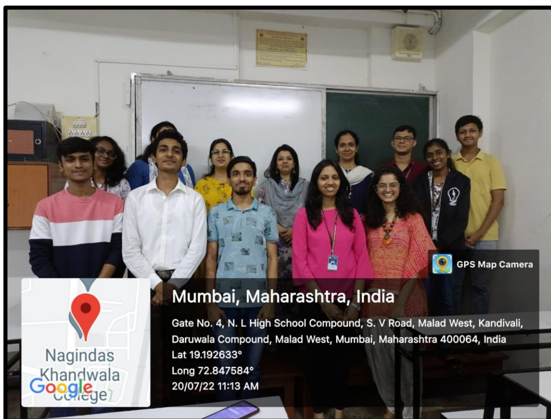
Incubate & Team – Incubation Cell