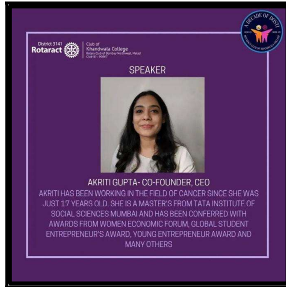
Sample photo of the event