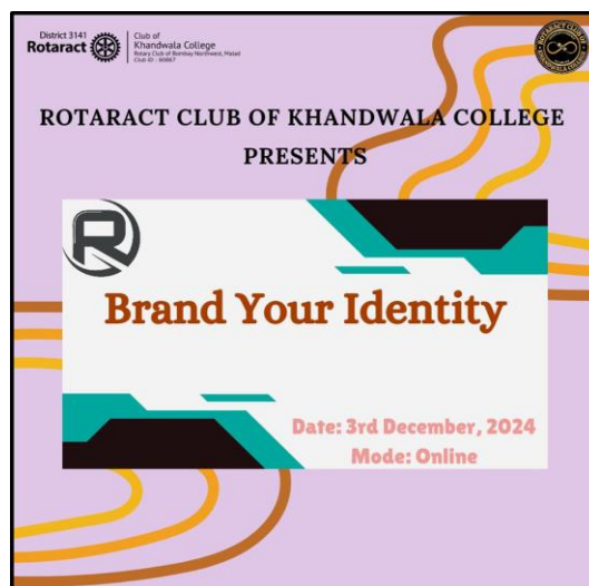
Brochure of the event

The first event, titled “Brand Your Identity,” was an Online Business Card Making Competition that aimed to spark creativity and self-branding among participants. Students were invited to design a business card that reflected their personal or professional identity. This activity allowed them to explore the importance of branding in today’s competitive world while combining elements of design, communication, and strategy. The event saw vibrant participation, with unique and thoughtful entries showcasing individuality and professional aesthetics.