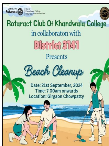
Brochure of the event