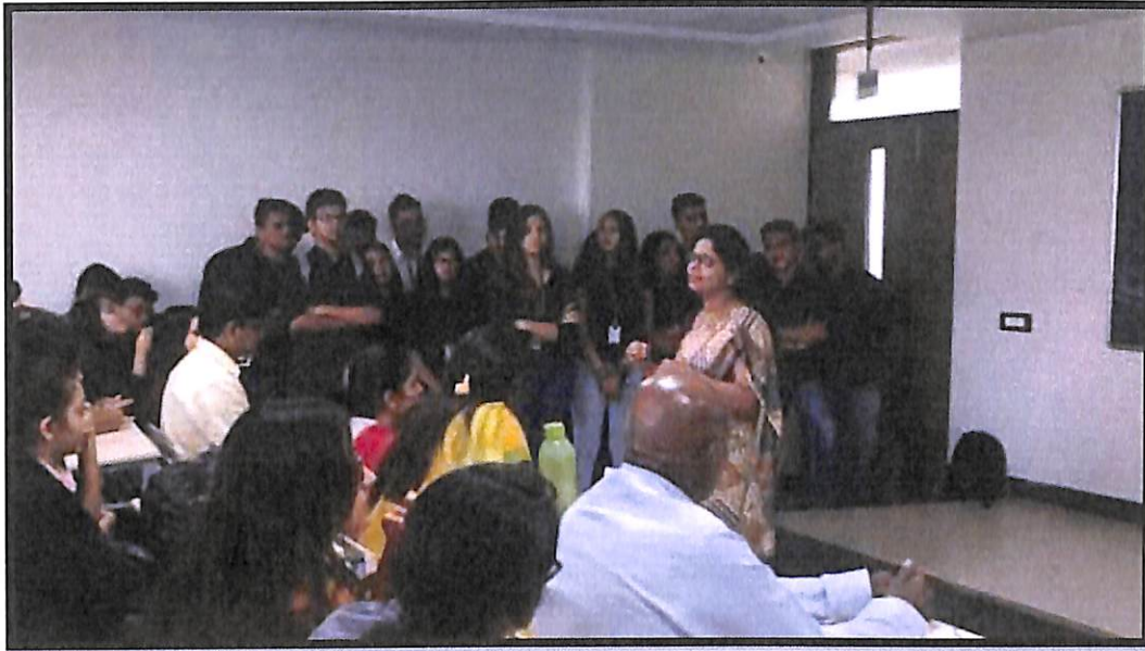
Orientation Programme – AY 2019-20

PRINCIPAL NAGINDAS KHANDWALA COLLEGE OF COMMERCE ARTS & MANAGEMENT STUDIES AND SHANTABEN NAGINDAS KHANDWALA COLLEGE OF SCIENCE (B. L. D. B. S.) MALAD (W), MUMBAI - 400 054