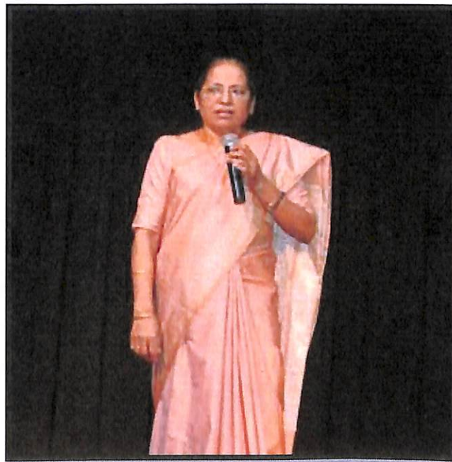
Orientation Programme – AY 2019-20