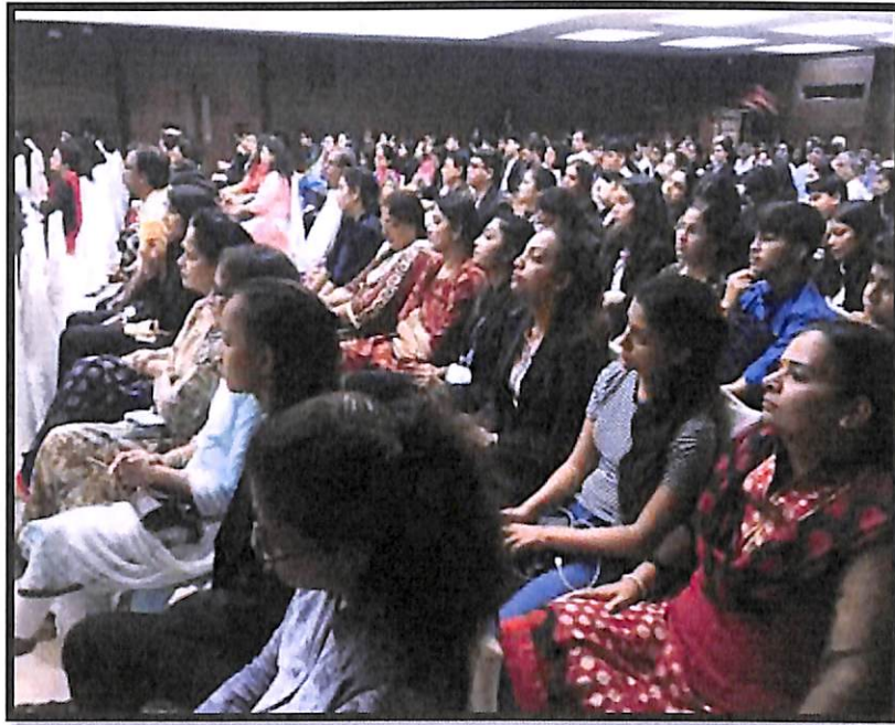
Orientation Programme – AY 2019-20