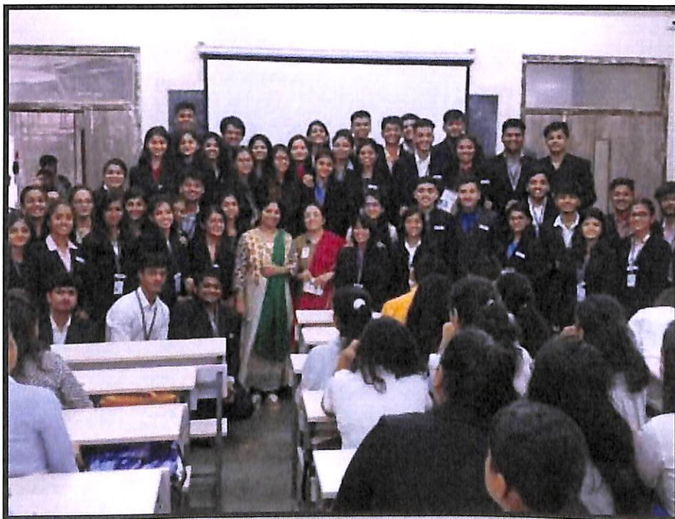
Orientation Programme – AY 2018-19