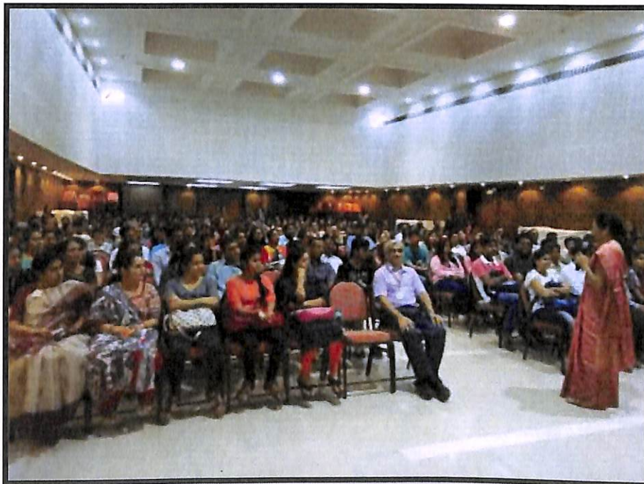
Orientation Programme – AY 2018-19