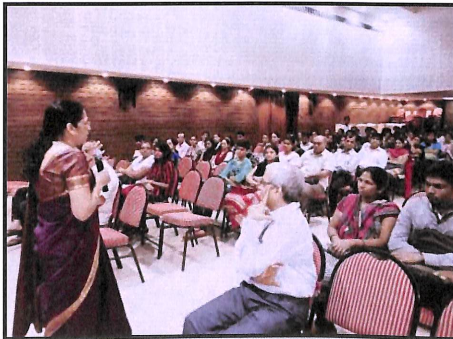
Orientation Programme – AY 2017-18