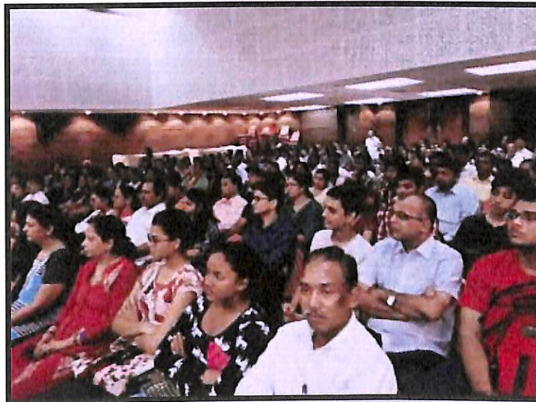
Orientation Programme – AY 2016-17