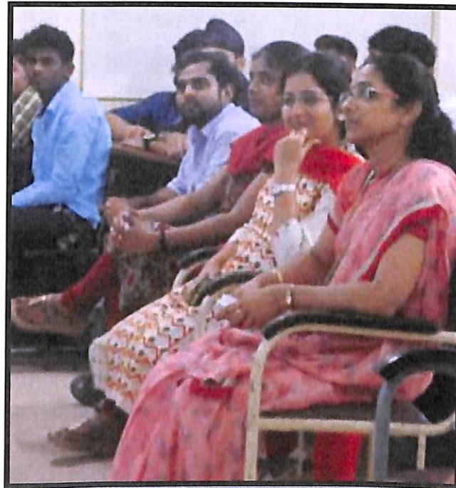
Orientation Programme – AY 2016-17

PRINCIPAL NAGINDAS KHANDWALA COLLEGE OF COMMERCE ARTS & MANUFACTURING STUDIES AND SHANTABEN NAGINDAS KHANDWALA COLLEGE OF SCIENCE (AUTONOMOUS) MALAD (W), MUMBAI - 400 084