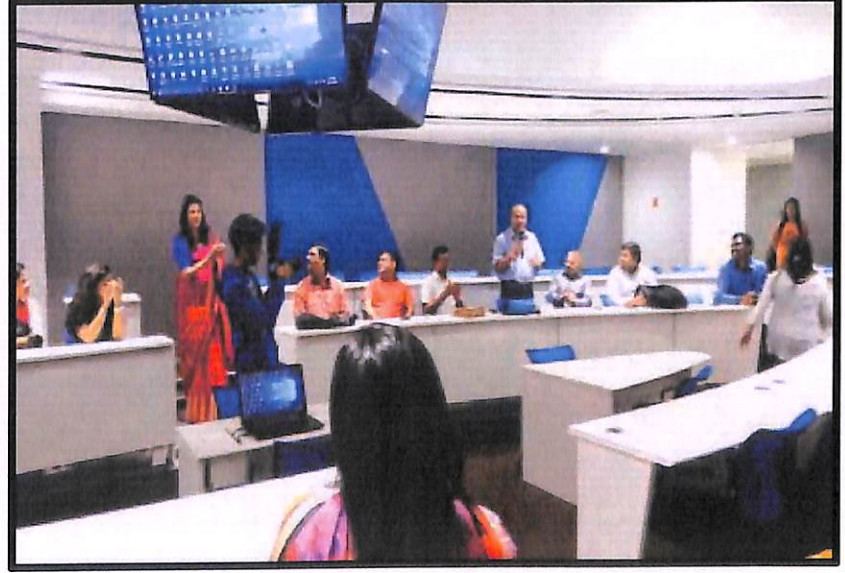
Train the Trainer