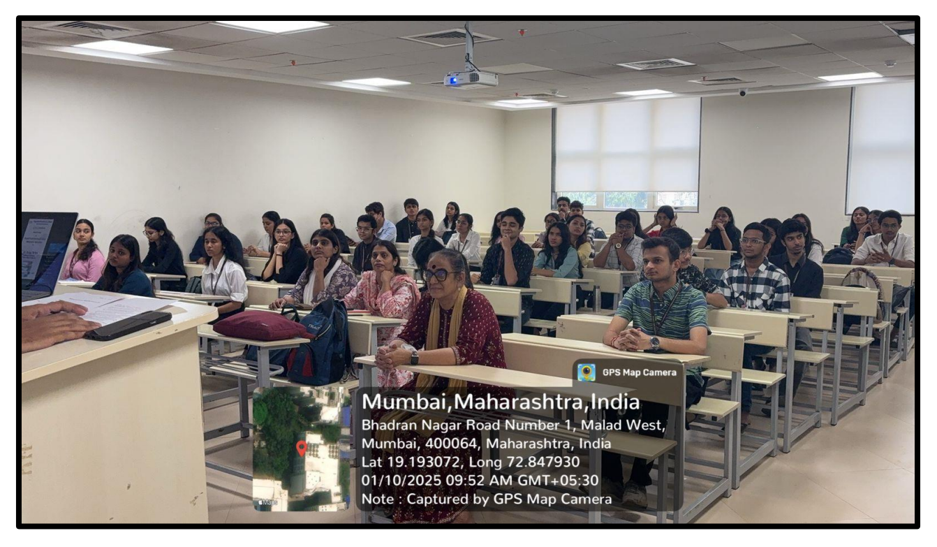
Guest Lecture Participants