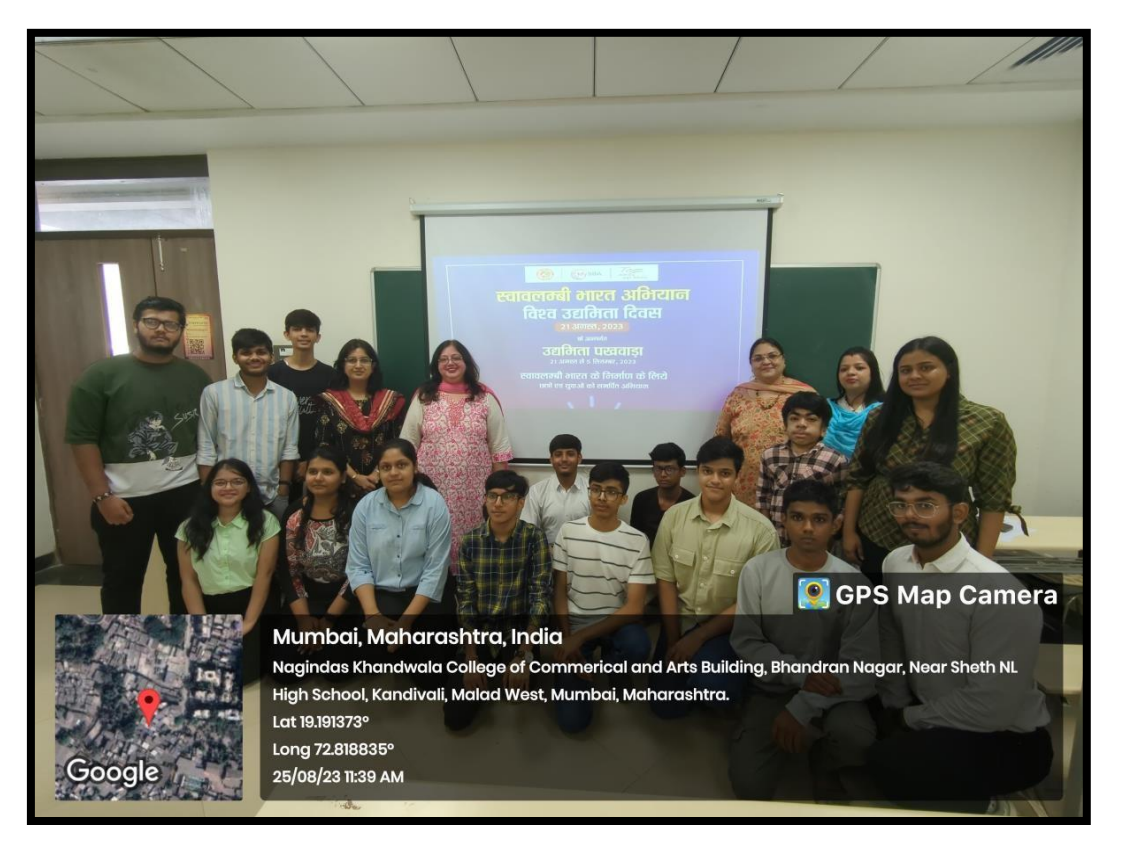
Participants during the celebration of World Entrepreneurship Day