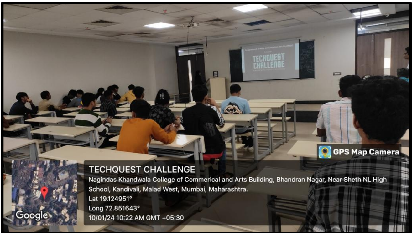
Participants of TechQuest Challenge