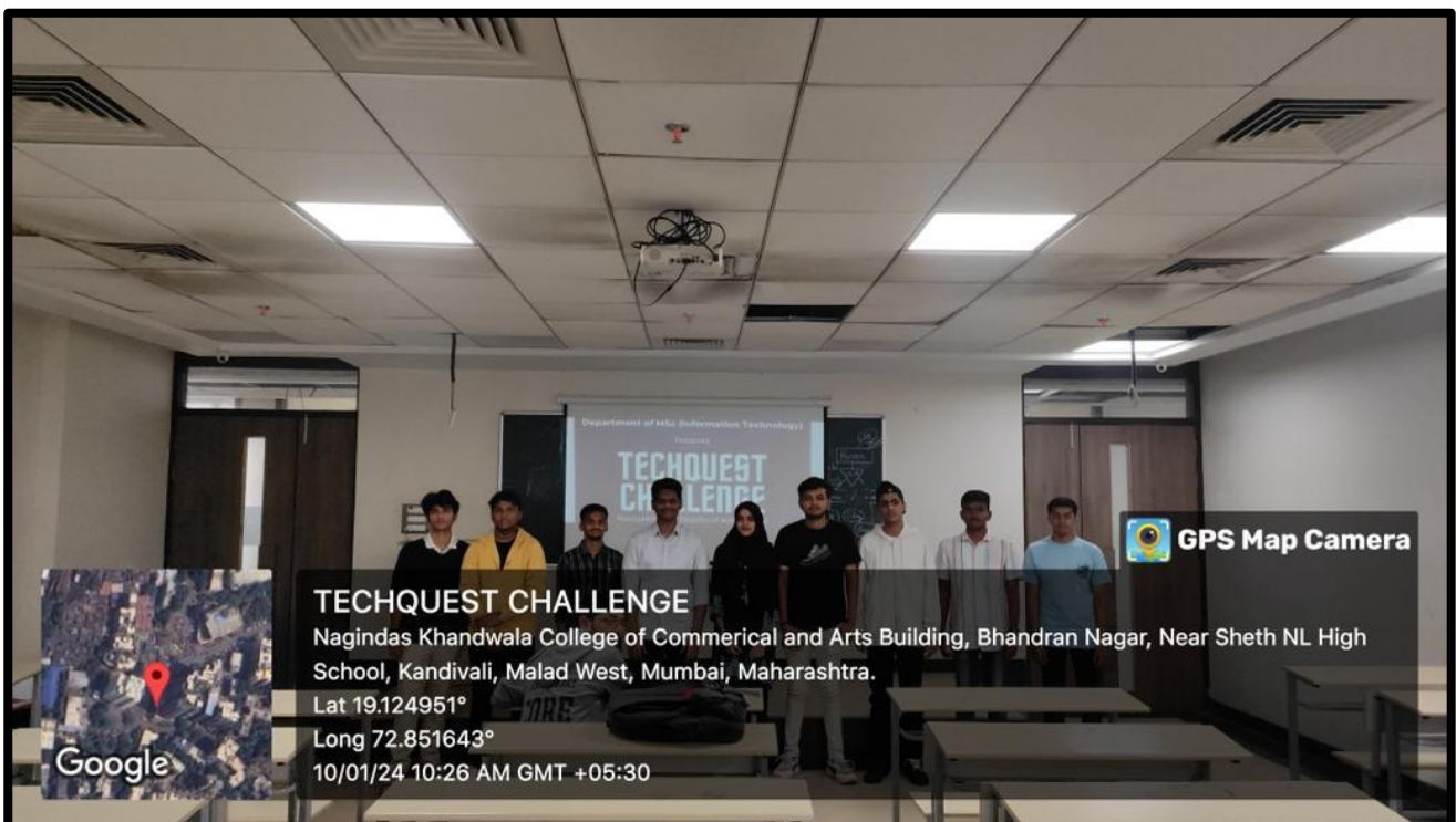
Group Pic with participants