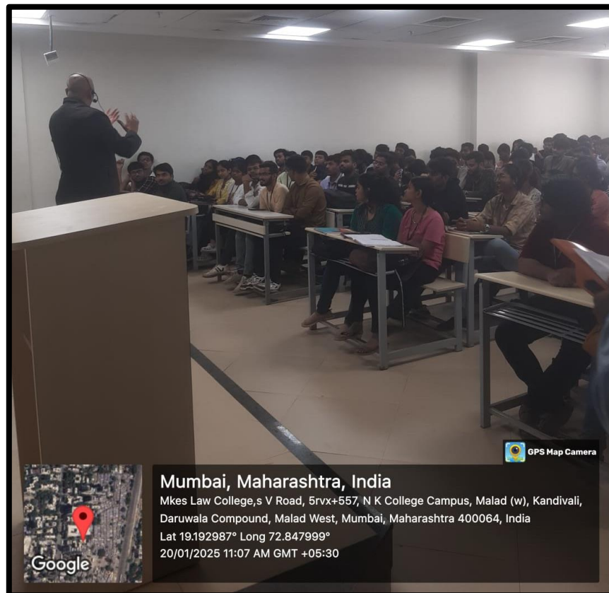
Sessions' Address by Speaker