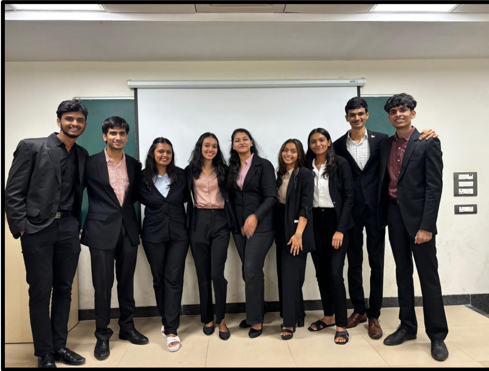
Team DCIS presenting the idea

Nagindas Khandwala College Empowered Autonomous