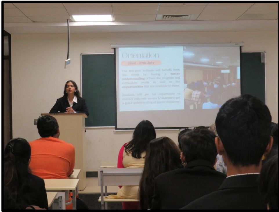
Team E-Commerce presenting the idea