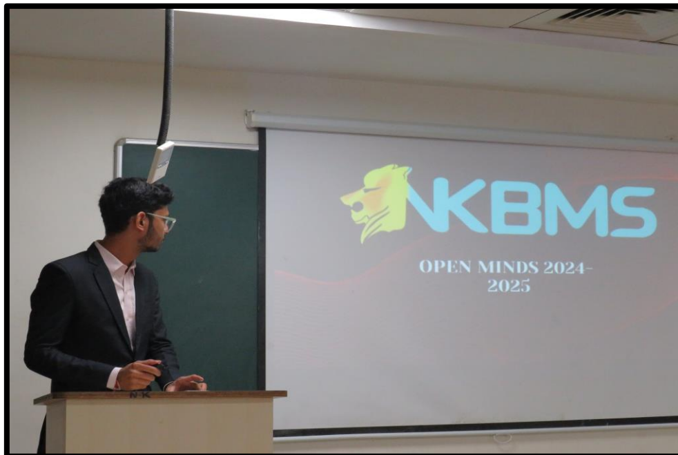
Team BMS presenting the idea