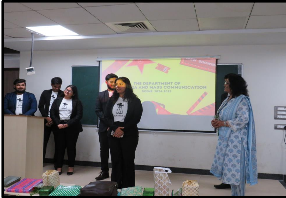
Team BAMMC presenting the idea