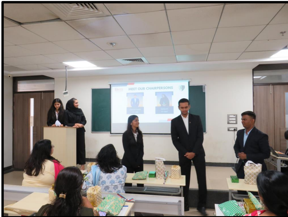
Team B-Section presenting the idea