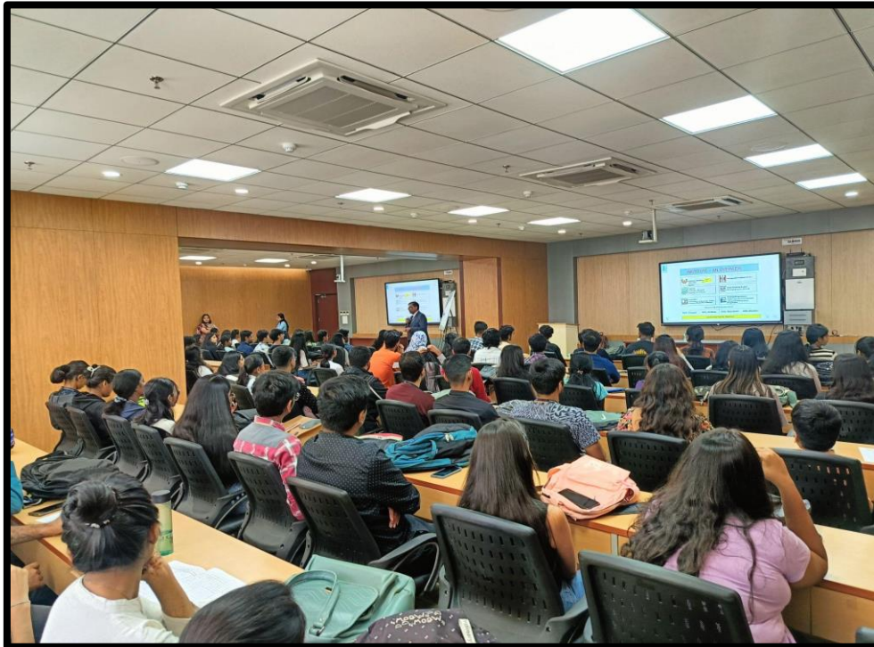
Masterclass on New age banking and capacity building