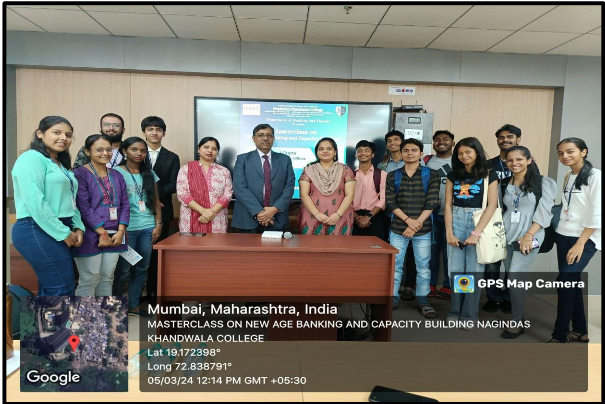
Masterclass on New age banking and capacity building