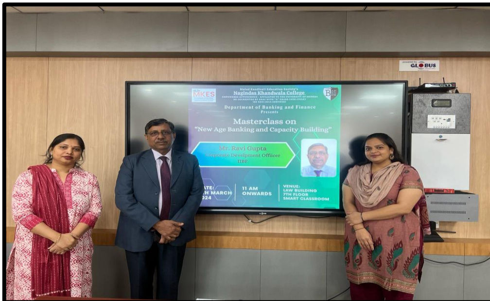
Masterclass on New age banking and capacity building