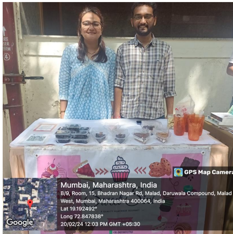
Photo capturing the vibrant participants