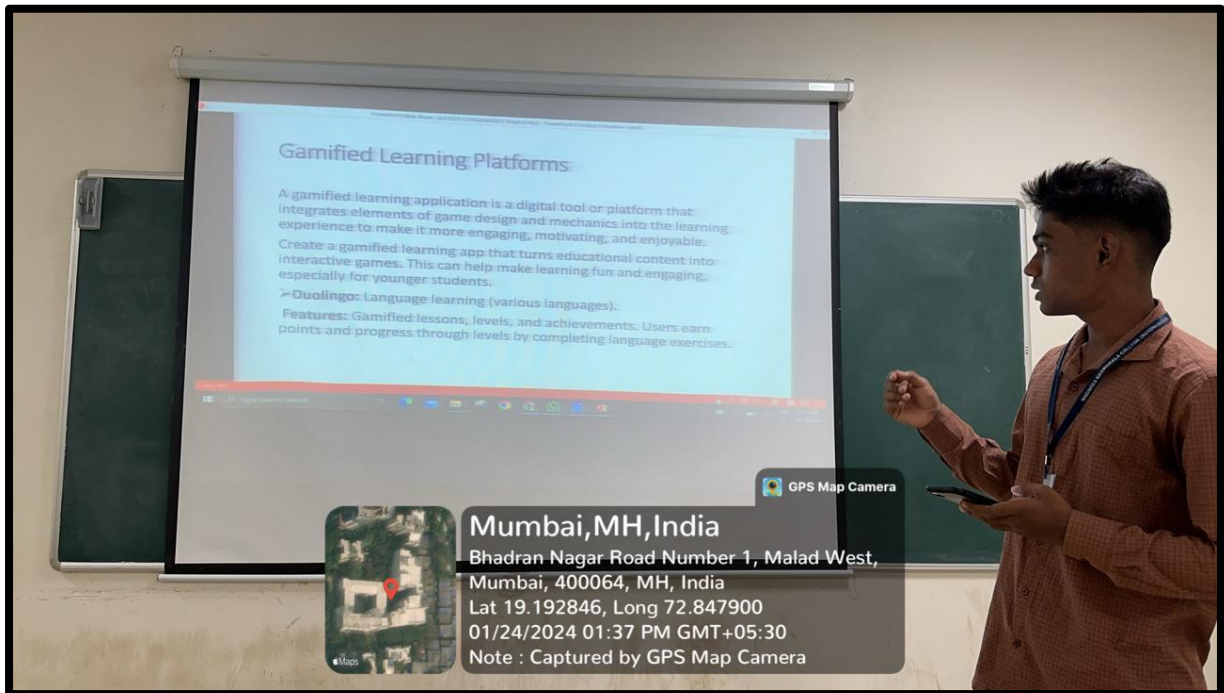
Participant passionately demonstrating an innovative tool