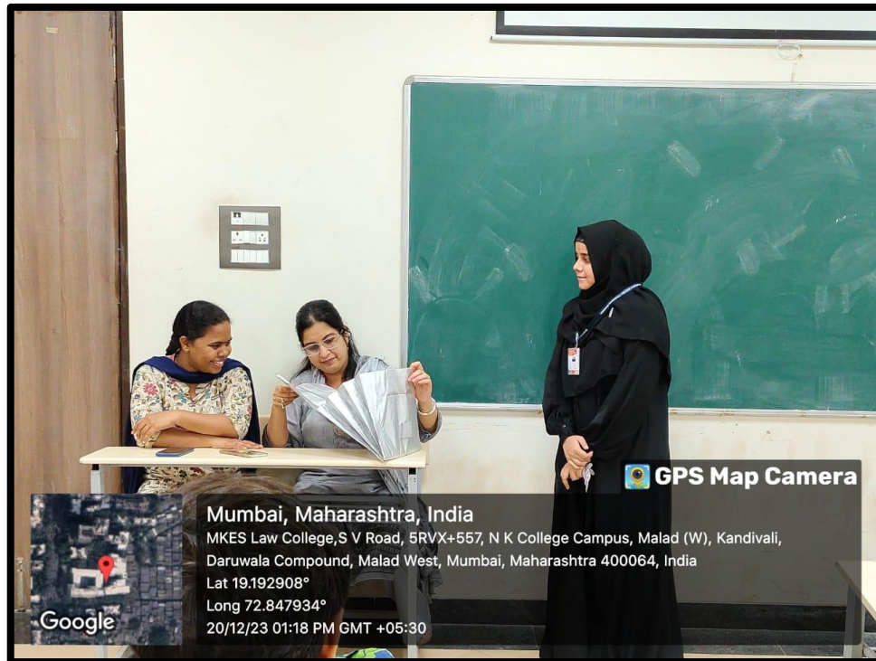
Participants showing her Eco-friendly Folder created with Newspaper