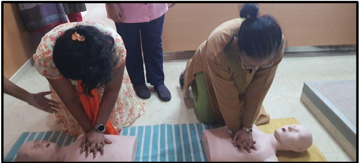
Faculty having practical demonstration for CPR Training