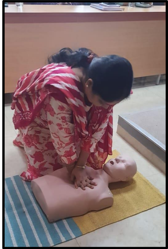
Faculty having practical demonstration for CPR Training