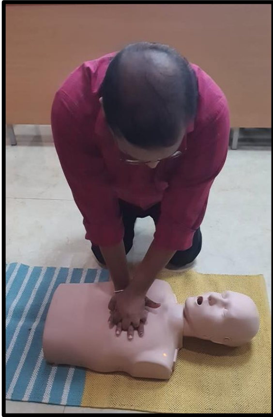
Faculty having practical demonstration for CPR Training