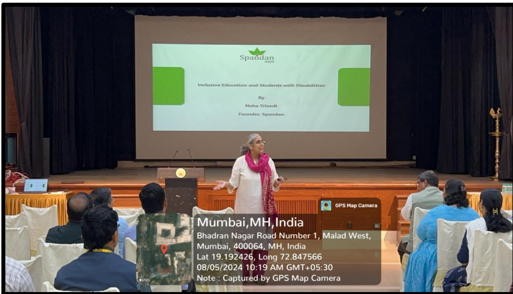
Day 1 – Disability Sensitization and Understanding 21 types of Disability