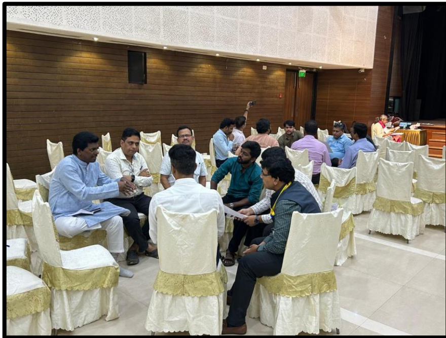
Day 1 – Group Activity