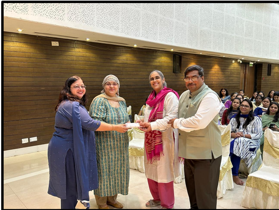
Dignitaries felicitating the Resource Person