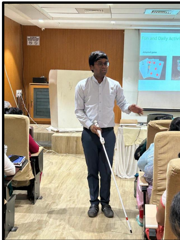
Day 2- Assistive Technologies and Teaching Strategies