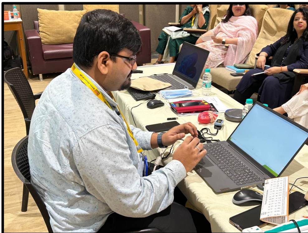
Day 2- Assistive Technologies and Teaching Strategies