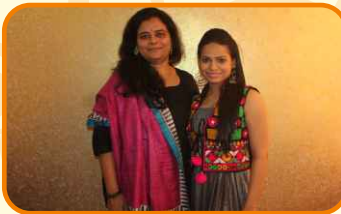
Sneha Kapoor Actress & Choreographer